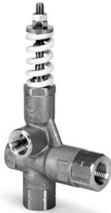
Model 7537 Shown